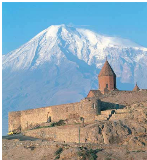
Khor Virap monastery

Visit to Khor Virap monastery located in the Ararat plain in Armenia, near the closed border with Turkey. The Ararat Mountain is making an amazing landscape. The taller peak reaches 5.165m, whereas the small one is just 3.900m high; they are separated from each other by the 11.3km distance. The Khor Virap Monastery is a shrine and a pilgrimage site important to the Armenian Christianity. The church complex is built atop the pit (= virap in Armenian), where St. Gregory the Illuminator was cruelly imprisoned, some time at AD 288 by the heathen Armenian King Trdat III. St. Gregory suffered his imprisonment in that pit for 14 years until upon miraculously curing the king of a loathsome disease, the king freed him and converted himself and Armenia to Christianity. In 301, Armenia was the first country in the world to be declared a Christian nation.