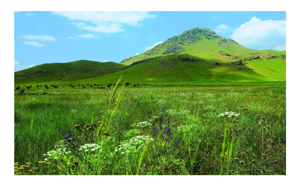
Arteni volcanic complex in Armenia