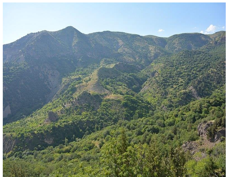
"Khosrov Forest" State Reserve