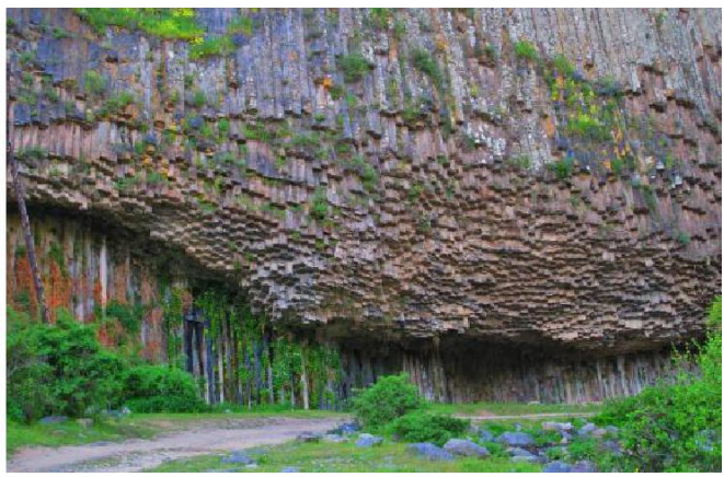
Garni columnar lava flow